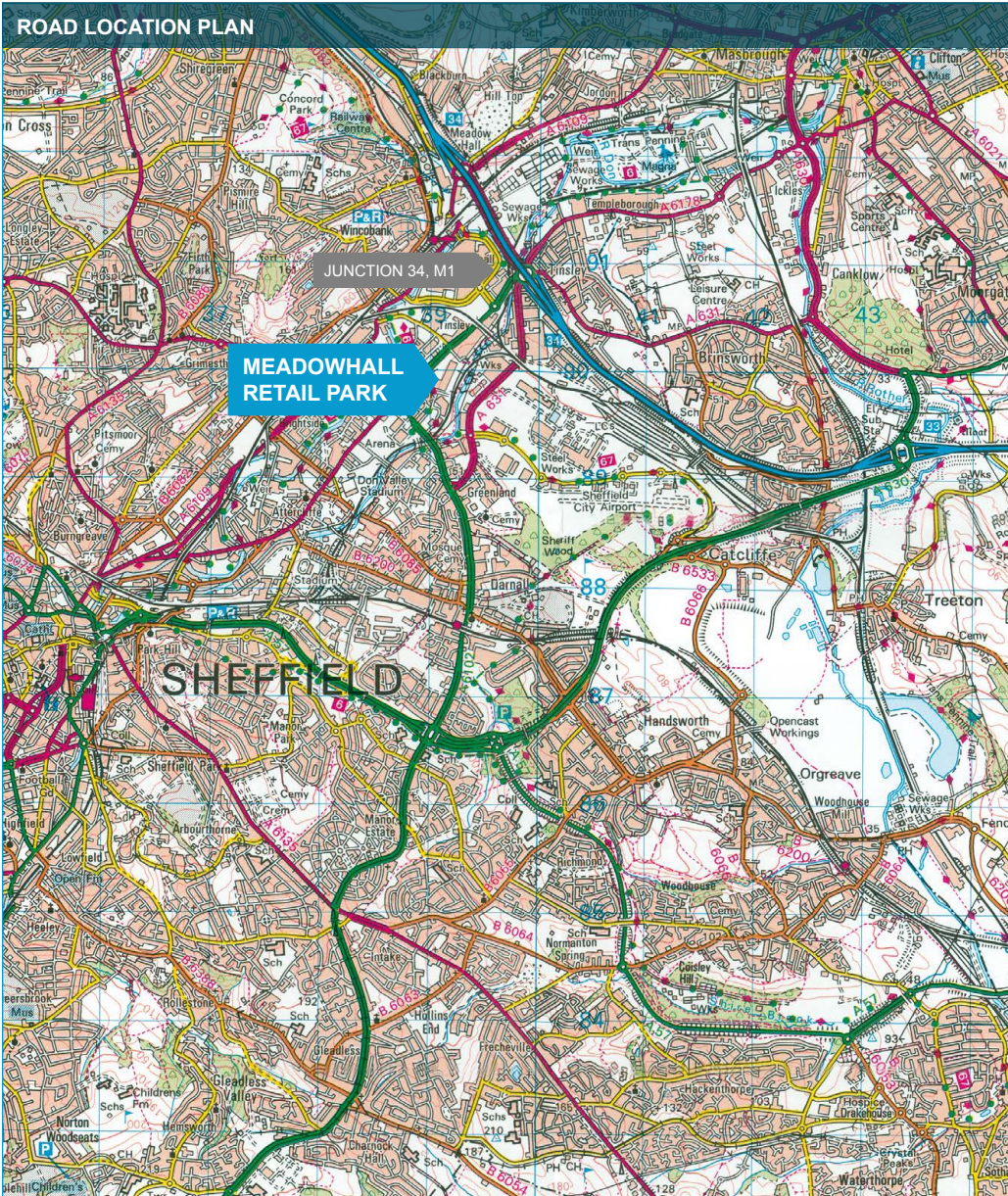
Extensive resident catchment population of 440,000 extending to 1.1 million within 20km