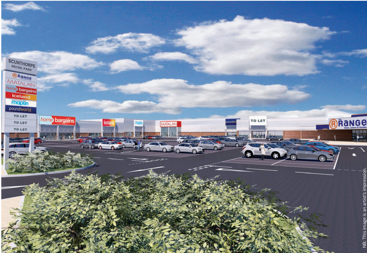
NB: This image is an artist's impression.