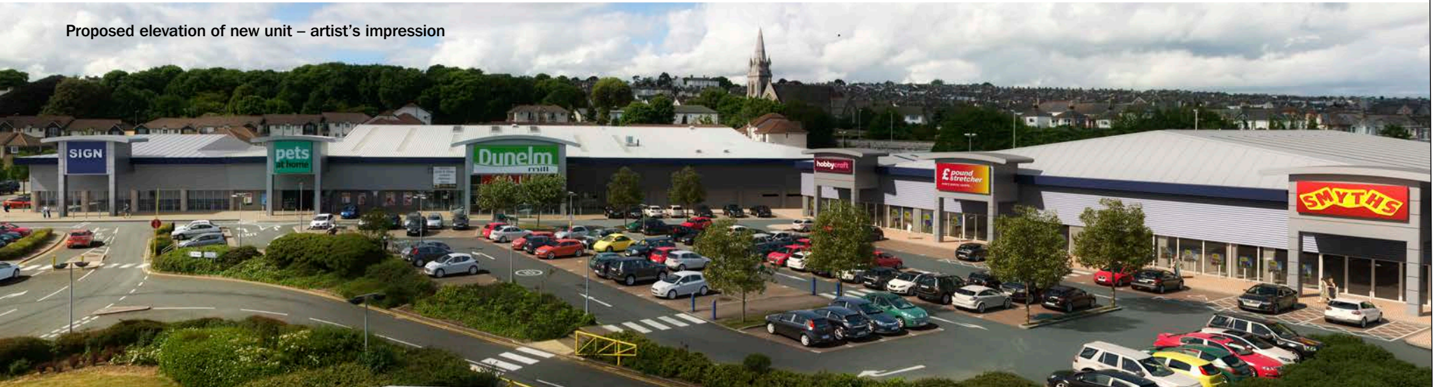
Proposed elevation of new unit – artist's impression

park size 80,284 sq ft customer parking 336 spaces planning Open A1 non food