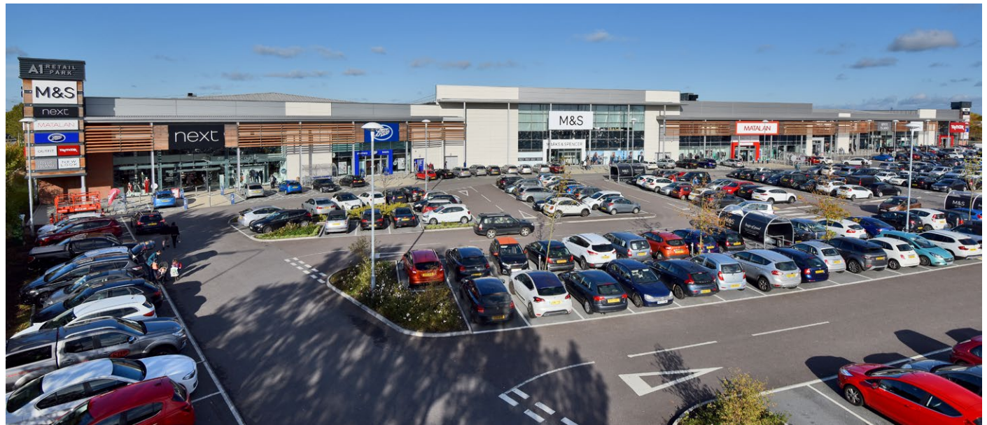
Q A1 Retail Park is highly visible from the adjacent A1 trunk road