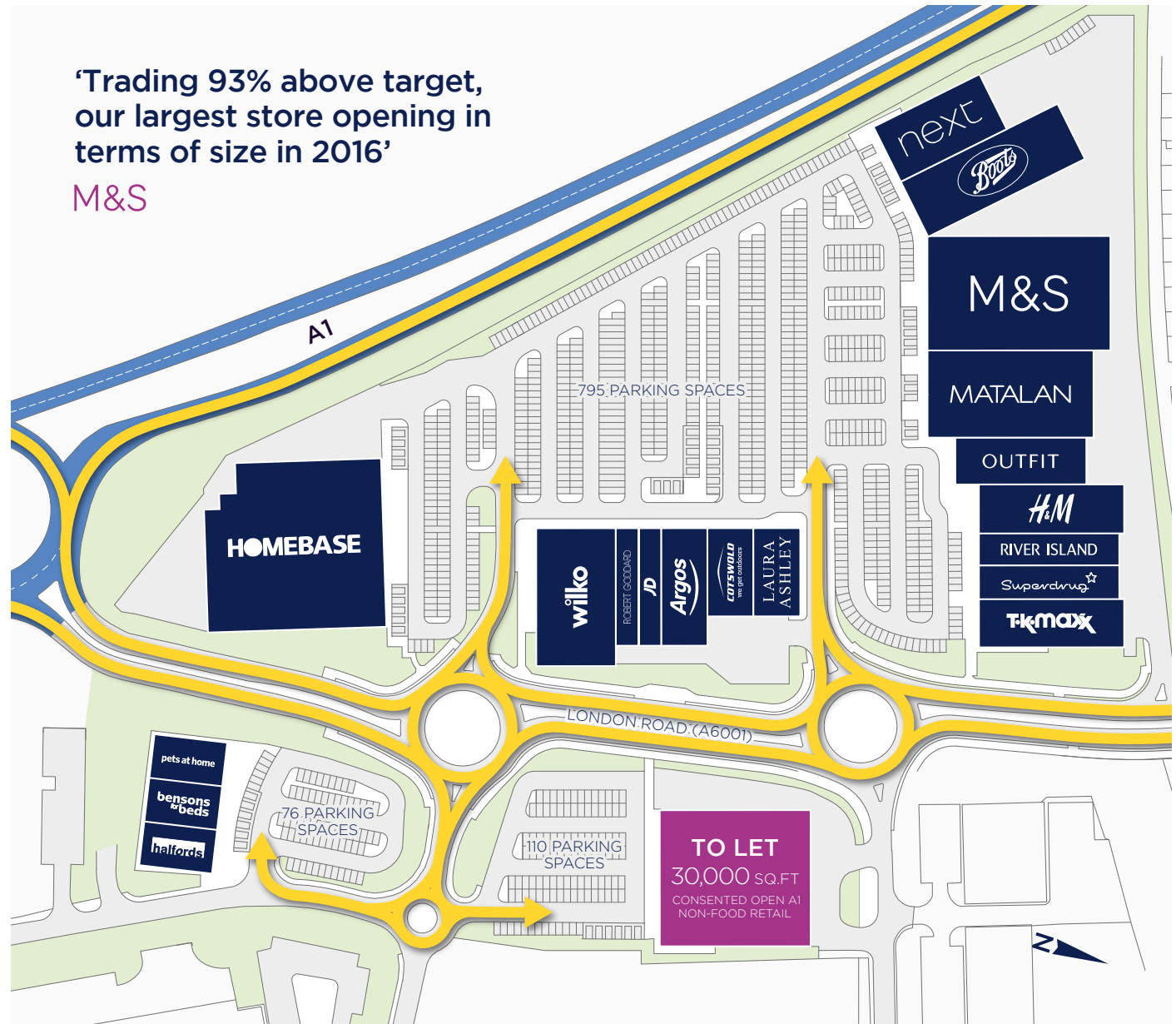
Q Planning consent has been received for a new 30,000 sq.ft retail unit